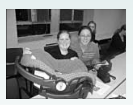
Au Pairs from Cultural Au Pair Participate in a Caregiver class at Morristown Memorial Hospital.

This year is the 15th anniversary of the National SAFE KIDS Campaign, the first and only national nonprofit organization dedicated solely to the prevention of unintentional childhood