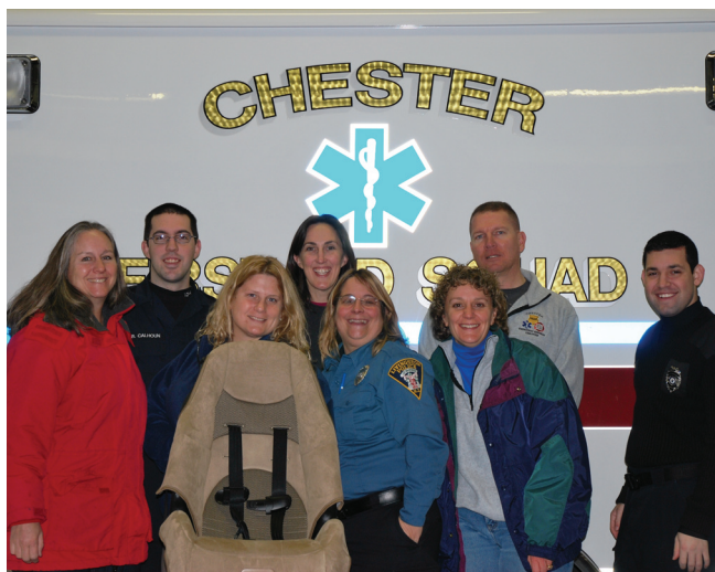
The Car Seat Technicians celebrated the 1st Anniversary of Chester's Car Seat Inspection Station on Jan. 21, 2010.

The Chester Car Seat Inspection Station celebrated its 1st Anniversary on Thursday January 21, 2010. The Child Passenger Inspection Station opened in January 2009 as an expansion to the Child Passenger Safety (CPS) Program of Northern NJ Safe Kids/Safe Communities. The station has become a visible force for CPS in Morris County. On average 15 car seats are inspected by our certified Child Passenger Safety Technicians.